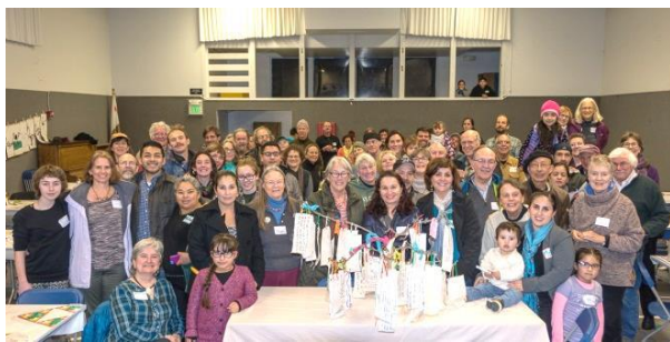
Una Comunidad Gathering on January 20, 2017

Abriendo Caminos , a partnership developed in 2014 between agencies in the West Marin Collaborative and the local Latino community to increase civic engagement and leadership, continued in Point Reyes and expanded to Tomales. With support from the Marin Community Foundation we were able to present trainings on new topics (e.g., Board Roles) and the group was involved in a wider range of community events. We also began planning an expansion of the program into Bolinas and San Geronimo that will begin in 2017-18.